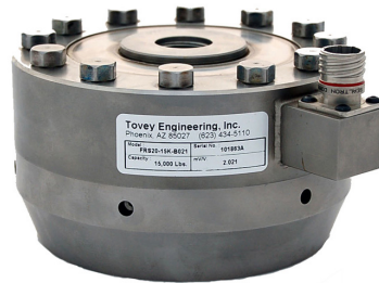
Note: Shown with Optional Connector and Connector Box